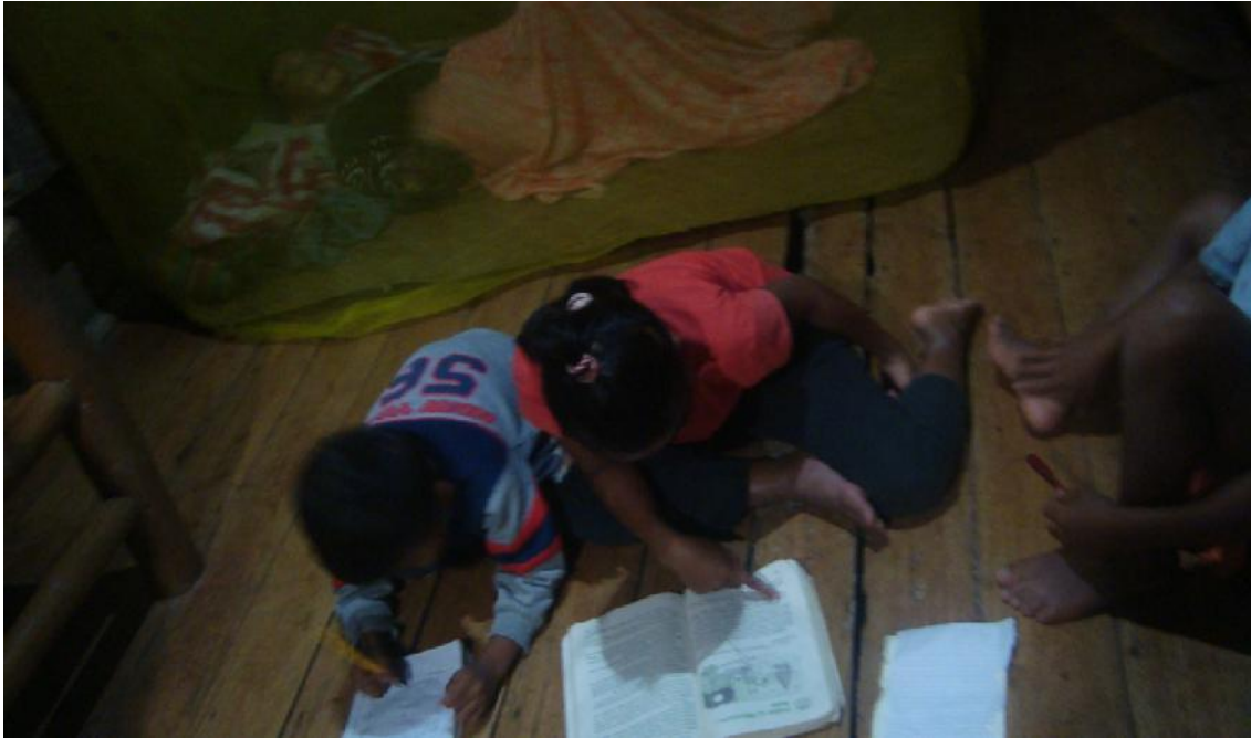
Children taking advantage of the electric lighting to do their homework.