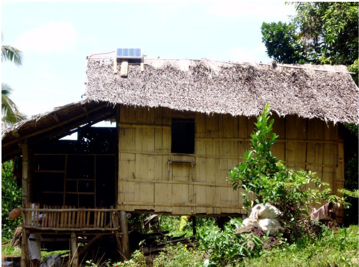
One of the ten Solar Electric Lighting Systems for the mountain families.