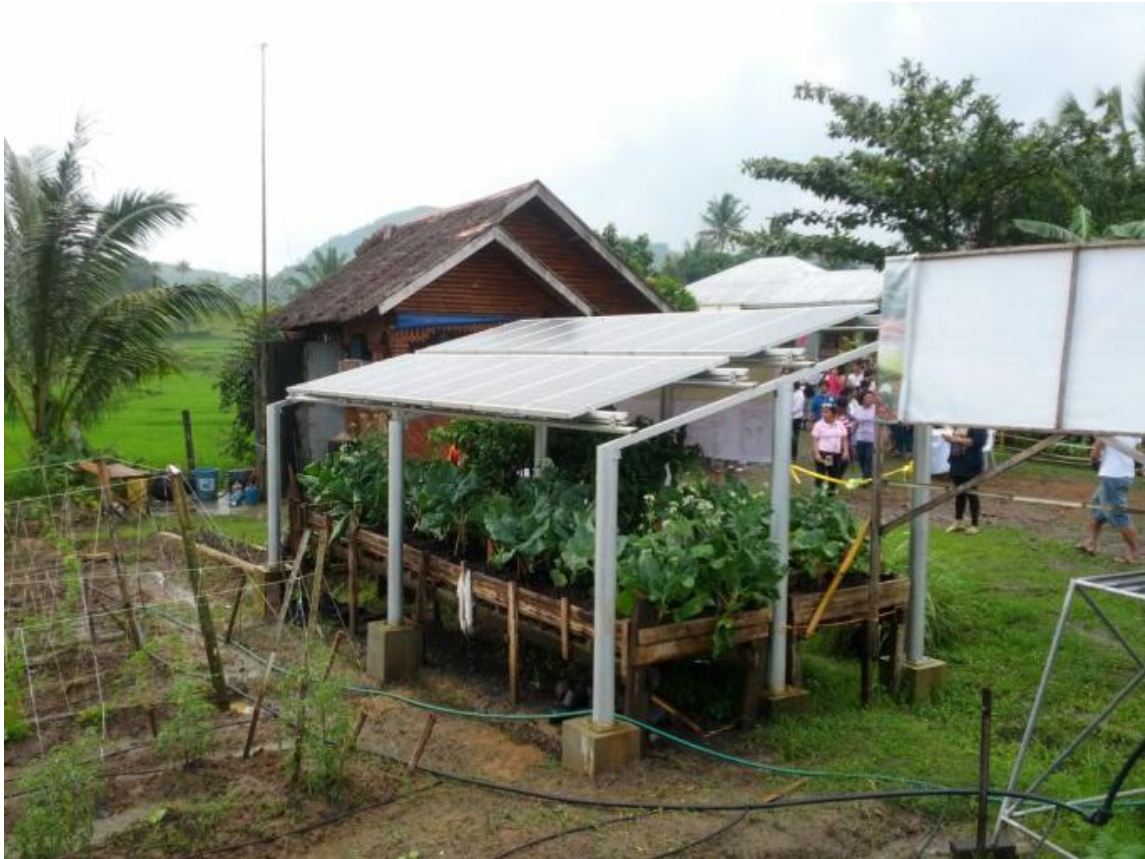
1 kW Solar Power Plant for the organic farm.